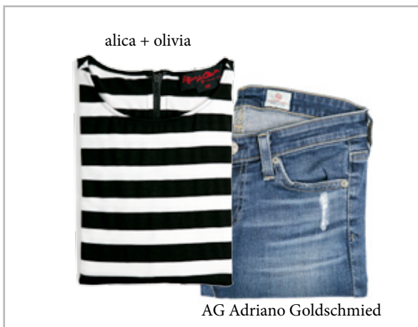
alica + olivia